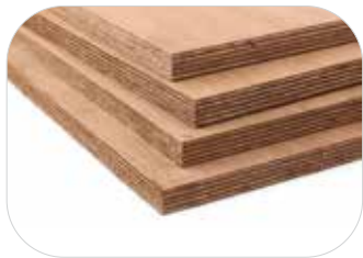
18 Mm Ply Wood