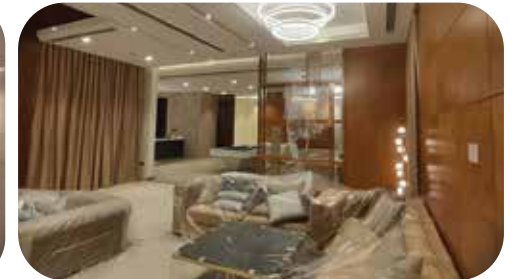
Construction of Private luxurious facilities