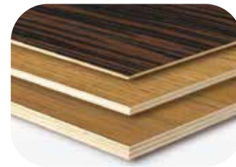
Decorative Ply Wood