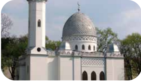
Mosque - 310 Sqft