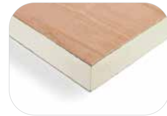
Wall Fitting Ply With Thermocol Insulation