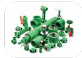
PPR Plumbing Fitting